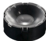
WINNIE (+ HLD-C)