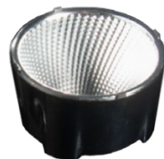
ADELY (+ HLD-C)