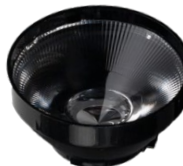
CARMEN (+ HLD-C)