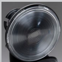
LENA D= 111 MM METALLIZED PC

CN12715_LENA-S CN12716_LENA-M CN12717_LENA-W CN12721_LENA-S-DL CN12722_LENA-M-DL CN12723_LENA-W-DL