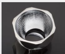
BRIDGET / LILY / CINDY D= 22.2 MM METALLIZED PC

CITIZEN CL-L230 C10982_CINDY-S C10983_CINDY-M C10984_CINDY-W