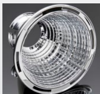
LENA D= 111 MM METALLIZED PC