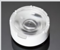
TINA3 D= 16.1 MM PMMA

CA12399_TINA2-RS CA12400_TINA2-D CA12401_TINA2-M CA12404_TINA2-O CA12402_TINA2-W CA12403_TINA2-WW