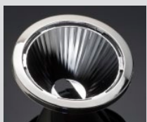
MIRELLA D= 50 MM METALLIZED PC

CITIZEN CL-L330 C12119_BROOKE-M C12120_BROOKE-W