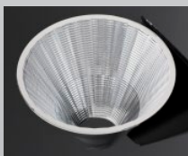
BARBARA D= 70 MM METALLIZED PC

CITIZEN CLL010 / CLL020 / CLL030 C12476_MIRELLA-50-S C12477_MIRELLA-50-M C12478_MIRELLA-50-W CN12483_MIRELLA-50-S-DL CN12484_MIRELLA-50-M-DL CN12485_MIRELLA-50-W-DL