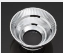
BROOKE (MOLEX) D= 45 MM METALLIZED PC

CITIZEN CL-L230 CP12351_BROOKE-SCR-M CP12352_BROOKE-SCR-W