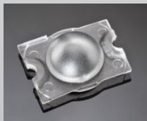
STRADA-C 15.4 MM X 19.6 MM PMMA

CITIZEN CL-L400 C11244_STRADA-DN CA11245_STRADA-DN