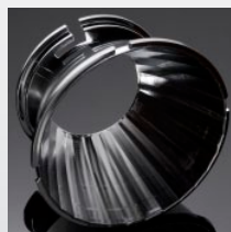
LENINA D= 74 MM METALLIZED PC

CITIZEN CL-L330 C11552_BARBARA-S C11553_BARBARA-W C12461_BARBARA-WW