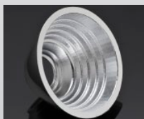
TYRA3 D= 40 MM METALLIZED PC

CITIZEN CL-L251 C10859_CINDY-S C10980_CINDY-M C10981_CINDY-W