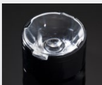
TINA2 D= 16.1 MM PMMA