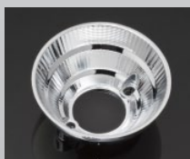
BROOKE-SCR D= 45 MM METALLIZED PC

CITIZEN CL-230 C12358_TYRA3-W C12359_TYRA3-WW