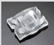
STRADA-DN 15.4 MM X 19.6 MM PMMA

CITIZEN CL-L400 C11242_STRADA-DW CA11243_STRADA-DW