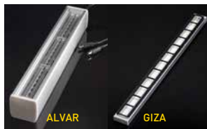
C14409_FLORENCE-1R-CLIP-B fits straight into aluminum profile (for example LEDiL's ALVAR or GIZA from Klus), no screws needed