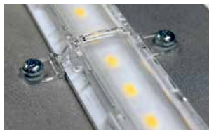
C14751_FLORENCE-1R-CLIP-C for 24 mm wide PCB's and screw mount